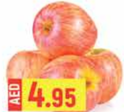
APPLE ROYAL GALA /KG