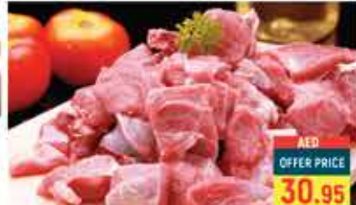
FRESH MUTTON /KG