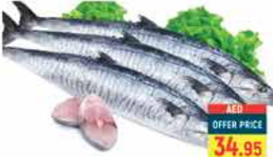
KING FISH /KG