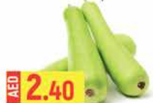
BOTTLE GOURD /KG