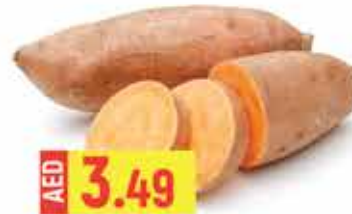
SWEET POTOTO /KG