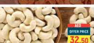
CASHEW ROASTED BIG /KG