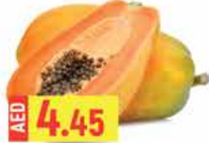
PAPAYA YELLOW /KG