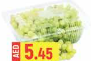
GRAPE WHITE BOX BIG