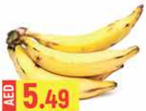
YELLOW BANANA/ KG