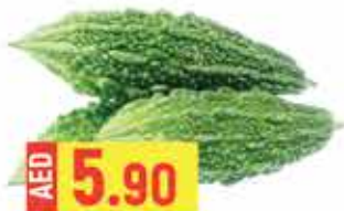
BITTER GOURD/ KG