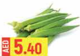
LADIES FINGER /KG