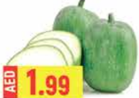
ASH GOURD /KG