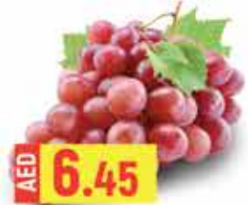
GRAPE RED GLOBE/KG